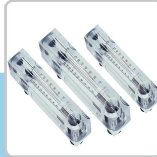
PANEL MOUNTED FLOWMETER