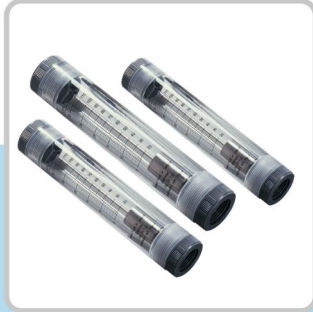
IN - LINE FLOWMETER

AquaSource in-line and panel mounted flowmeter are machined of premium quality of polished crystal clear Acrylic materials. Internal parts constructed with SS316 materials enhance the corrosion and wear resistances. Removable bulkhead nut avoids the troublesome to separate the mounting screws. Dual scale readings eliminate the errors of unit conversions. It is good choice across our water and wastewater treatment equipment and systems.