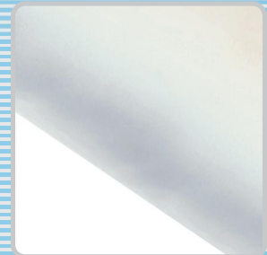
Mill finishing is an option