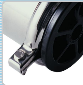
Half-clamp design holds the endcap closure in position