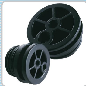
Double O-ring design ensures no leakages