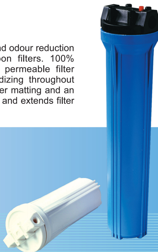
HS - PVC Filter Housing series