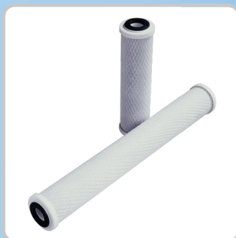
HS - CB series